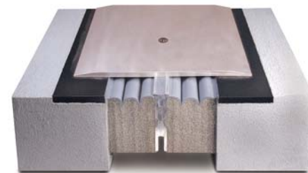
Pictured with optional elastomeric nosing