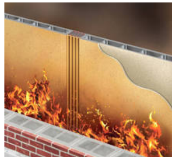
Click Here to Enlarge Picture