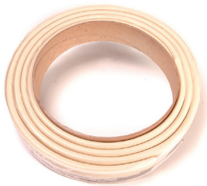
Colorseal-On-A-Reel provides a 10-ft (3m) length on a single reel.

Sealant-coated, precompressed, primary seal for rapid installation into small joints in vertical and horizontal planes.